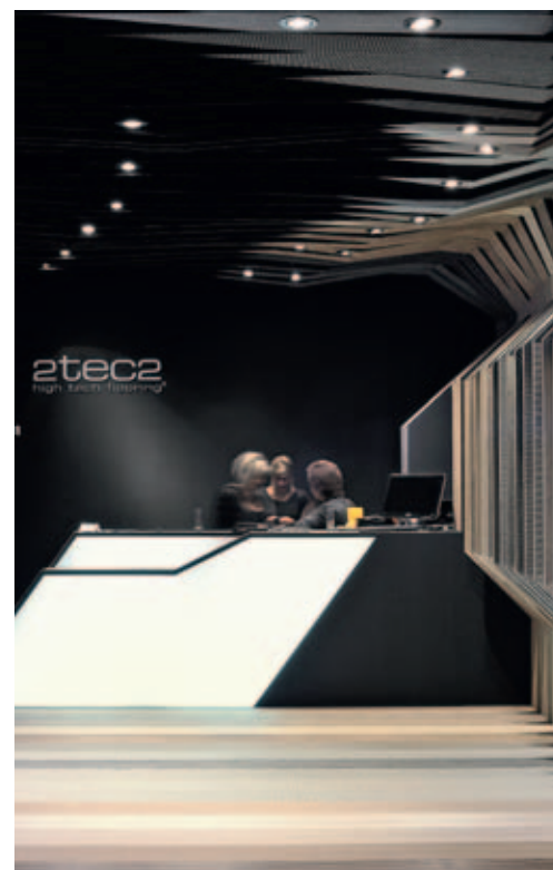
LABSCAPE'S EXHIBITION DESIGN FOR 2TEC2 SUCCESSFULLY UTILIZED FLOORING AS A BUILDING MATERIAL.