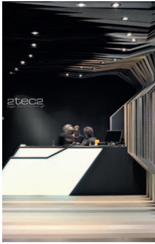
LABSCAPE'S EXHIBITION DESIGN FOR 2TEC2 SUCCESSFULLY UTILIZED FLOORING AS A BUILDING MATERIAL.